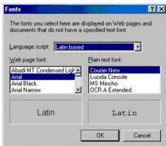
fig 3 (Internet Explorer Fonts dialog box)