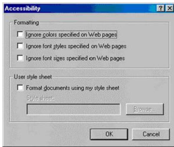
fig 2 (Internet Explorer Accessibility dialog box)