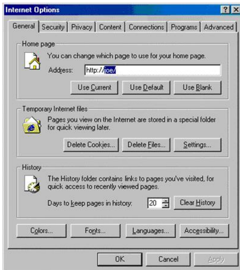
fig 1 (Internet Explorer Internet Options dialog box)